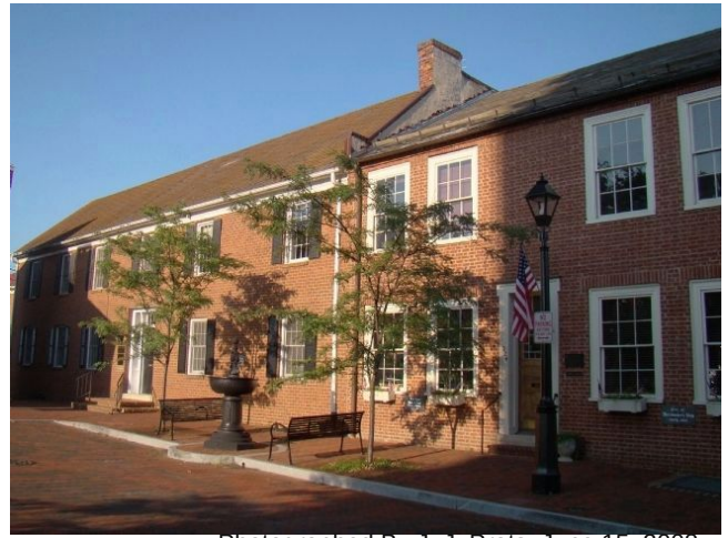
June 15, 2008