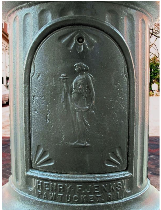
Photographed By Allen C. Browne, March 21, 2010