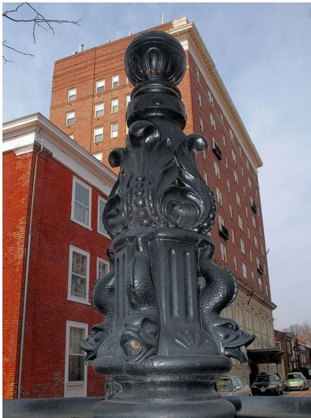
March 21, 2010