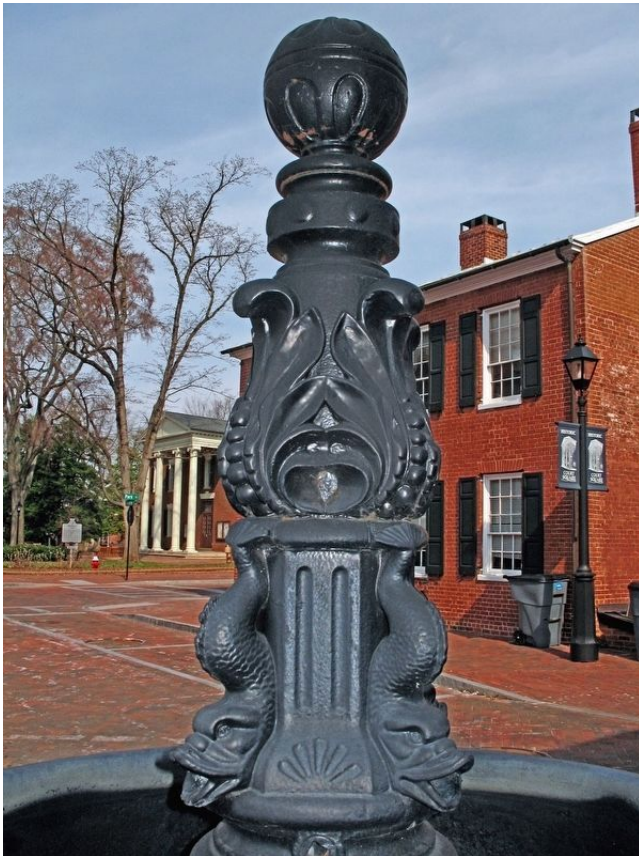
Photographed By Allen C. Browne, March 21, 2010