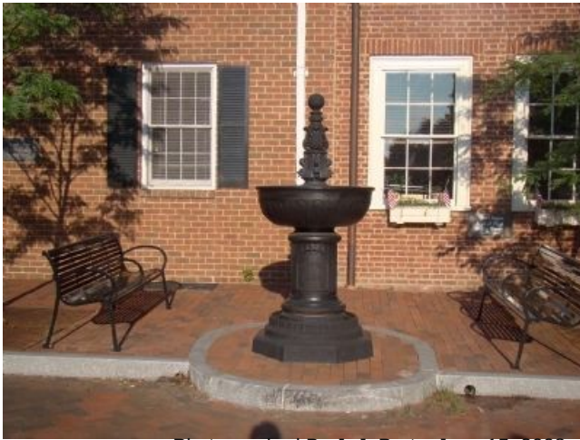
June 15, 2008